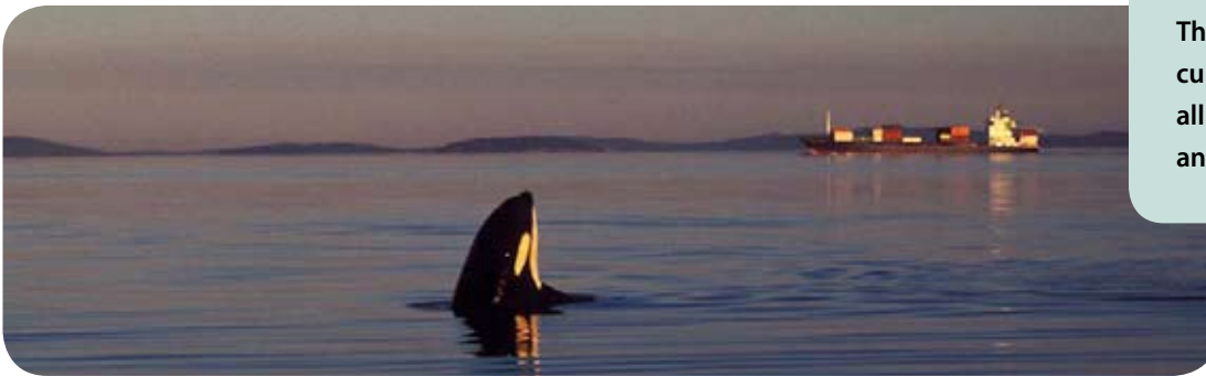
Orca and freighter.

There is a real-time map with the current position and direction of all major ships in transit and at anchor. To see the map click here .