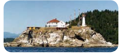
Chrome Island Light Station