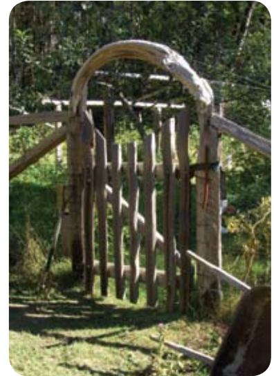
Gate on Lasqueti Island.

To learn more about NAPTEP, click here or phone 250.405.5186 (toll free 800.663.7867).