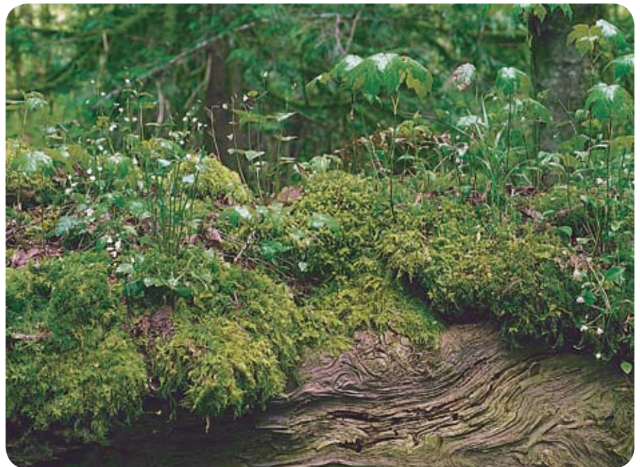
Nurse log.

Property owners with this type of ecosystem can protect both mature forests and the other sensitive ecosystems these forests buffer by maintaining the largest possible patches of trees, allowing natural disturbances and decay to occur, and restricting access by vehicles and livestock. Tools for permanent protection of mature forests such as conservation covenants or nature reserve designation are also available from conservation agencies such as the Islands Trust Fund and your local island conservancy. For more information on mature forests and what you can do to protect them, visit the Islands Trust Fund here .