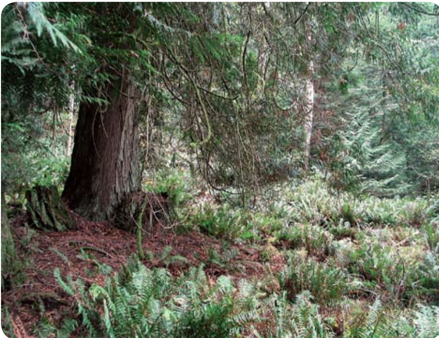
Frog Song Covenant.